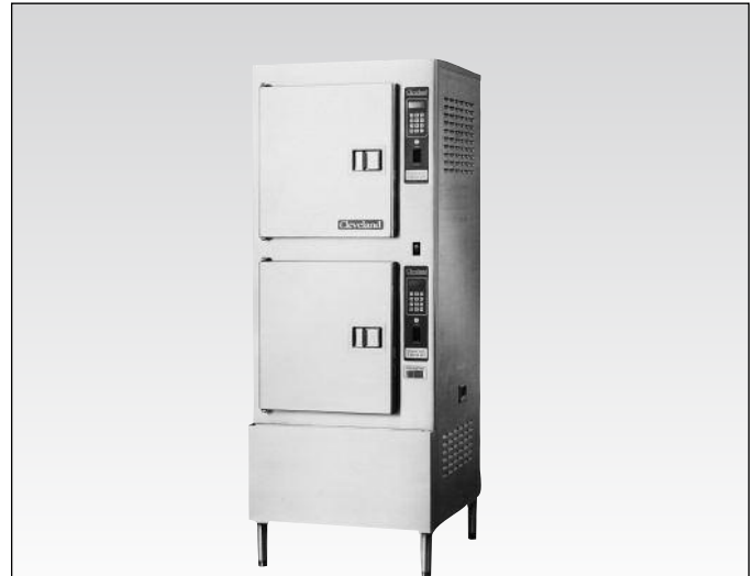
Shown with optional Electronic Timer